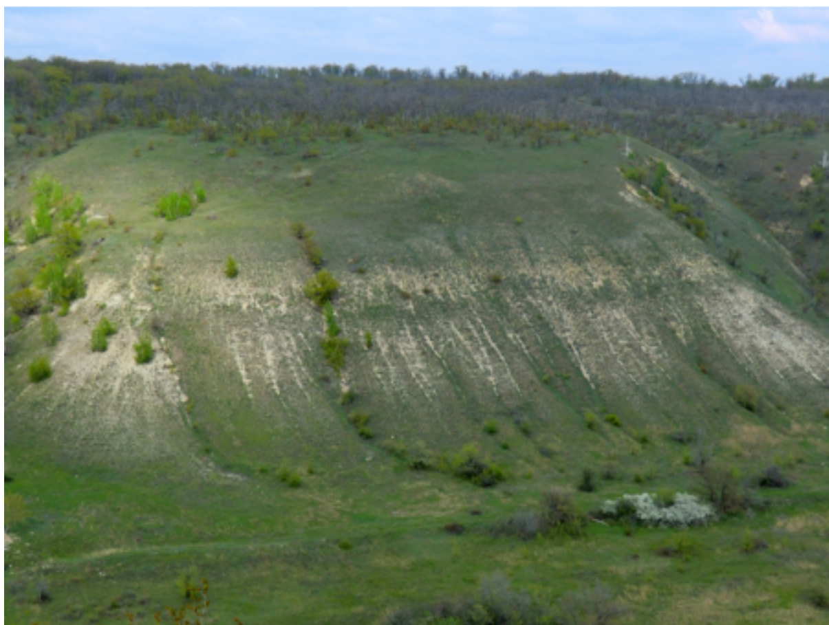
Figure 3 Shcherbakovsky hollow [14]

The most well-known location of the natural park is natural monument природы Shcherbakovsky hollow (Figure 5); its age is about 50-60 million years, and depth of the ravine – 200 meters. Here flows the only mountain river of Volgograd Oblast - Shcherbakovka (Figure 4); due to its quick current, the air remains cool even in summer. The hollow is a home to plants and animals from the Red Book.