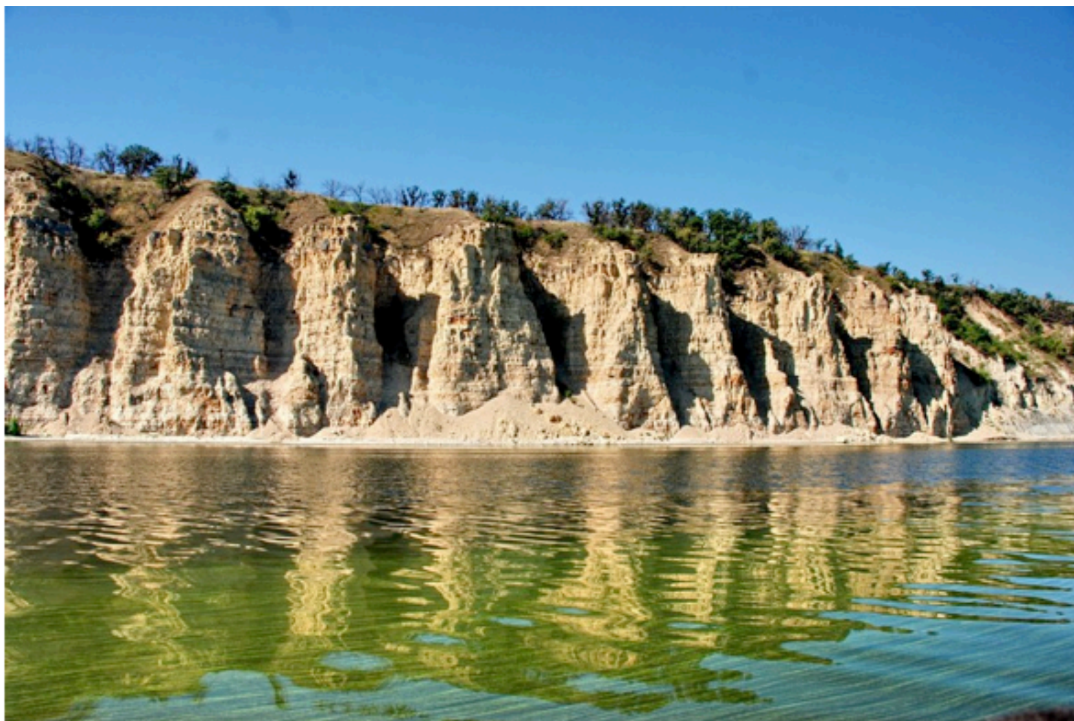
Figure 5 Stolbichi [16]

Another natural landmark, Urakov Hill is a very interesting site, known for the large number of artificial caves. Their origin is still unknown – from the historical point of view. According to the legends, the Khan Urak lived here – a master of local lands. He was killed in a battle by Stepan