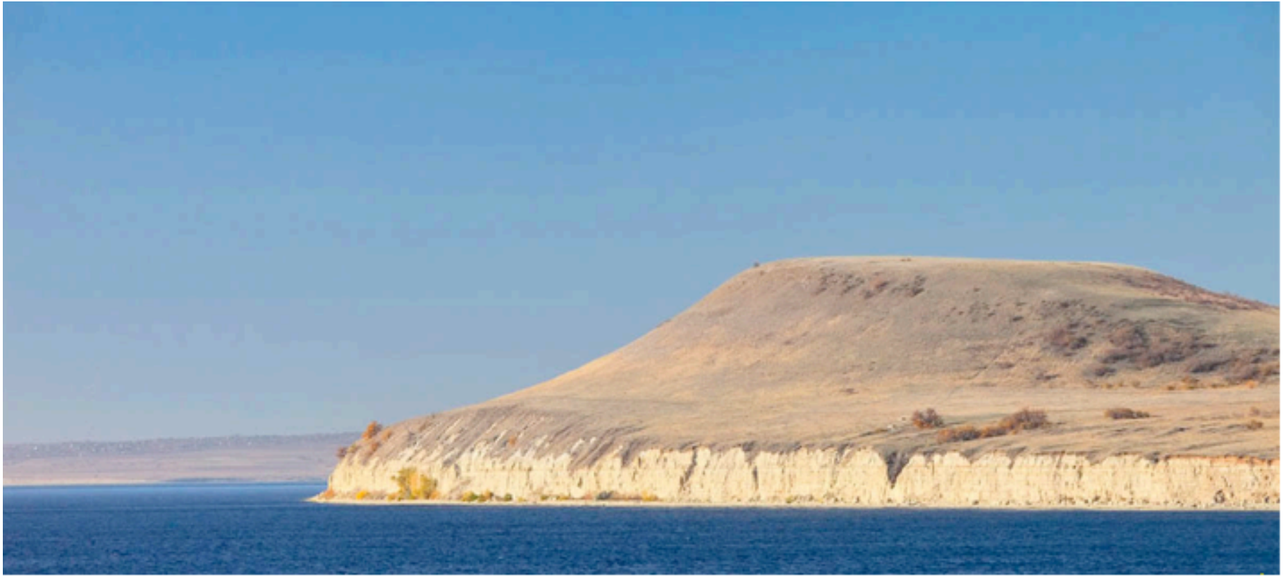
Figure 6 Urakov Hill [17]